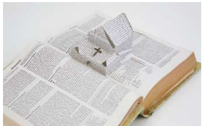
ARCHIE MOORE MALTHEISM 2007 folded pages of Bible.