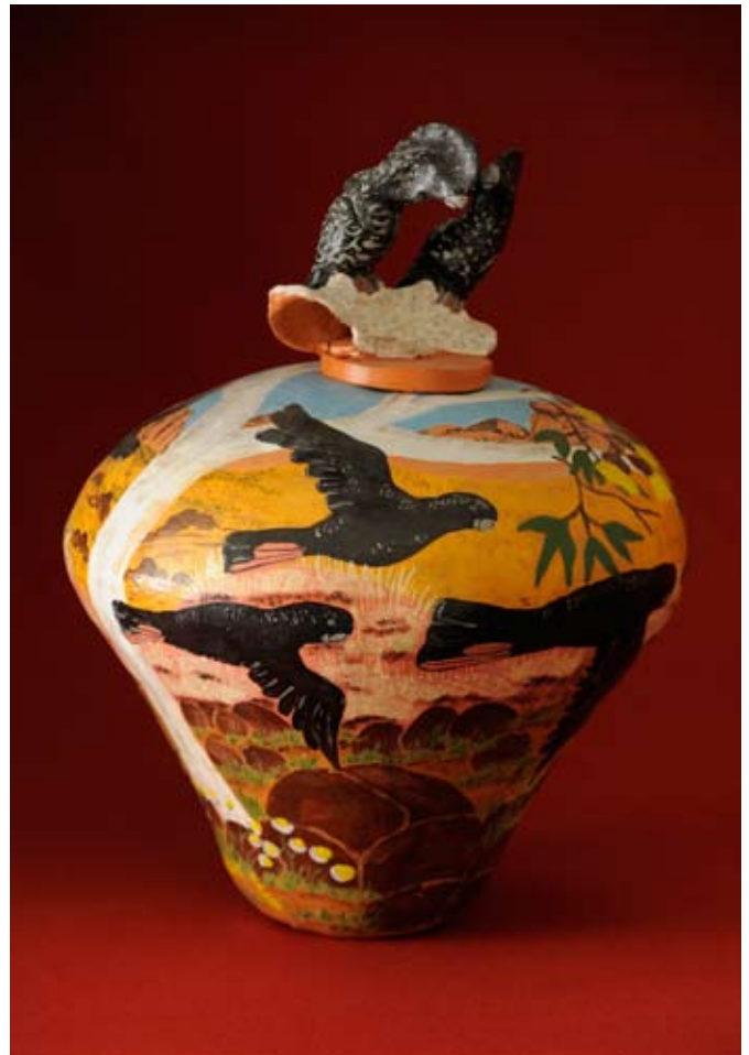
CAROL RONTJI BLACK COCKATOOS (detail) 2005 terracotta with underglaze 42 x 32 x 32 cm

This exhibition presents high quality significant work by a group of unique and talented artists that celebrates the diversity of art practice taking place in contemporary Indigenous communities.