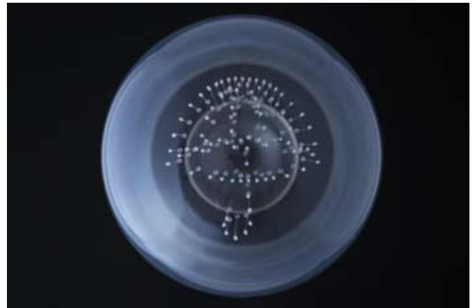
TRISH ROAN FALLING (detail) 2009-10 blown glass, glass beads, rayon thread, water. Made with the assistance of Brian Corr.

Tour De Force: In Case Of Emergency Break Glass is a groundbreaking exhibition that highlights the work of eight progressive Australian artists who have made work that breaches the traditional ideas, methods and materials of glass making. The exhibition brings new focus to the medium of glass, particularly the conceptual branch of the practice. Masterfully crafted and exquisitely realised, this provocative exhibition is a celebration of genuine artistic integrity – and as such is set to both challenge and inspire a new generation of studio glass artists. Curated by renowned glass rebel Megan Bottari, Tour de Force is not for the faint of heart.