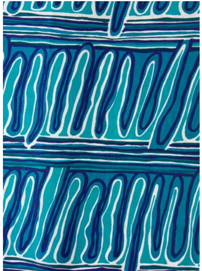
JIMMY PIKE JILJI, YUKA, PARTIRI c.1988 cotton.

Desert Psychedelic: Jimmy Pike is curated by artisan and toured by Museum and Gallery Services Queensland. This exhibition is supported by Visions of Australia, an Australian Government program supporting touring exhibitions by providing funding assistance for the development and touring of Australian cultural material across Australia. The Desert Psychedelic exhibition is supported by the Commonwealth, through the Australia-China Council which is part of the Department of Foreign Affairs and Trade.