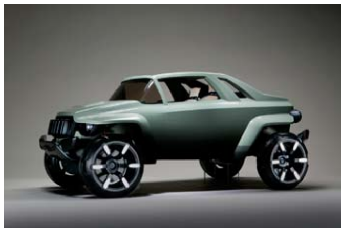
MILTON RUIZ JEEP high-density foam, mixed media, 45 x 90 x 45 cm