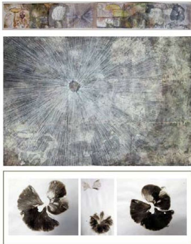
AILIE JAMES-MCMASTER SPORULATION FROM THE UNIVERSAL VEIL 2010 mixed medium 1200 x 1600 x 4 cm (St Hilda's School)