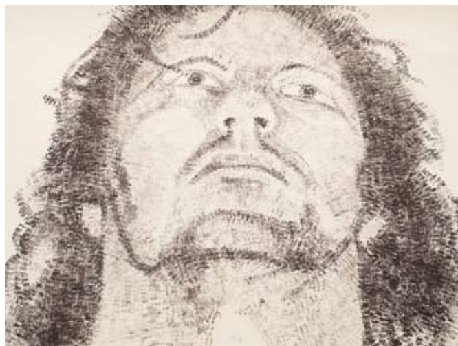
ARCHIE MOORE POOR-TRAITS (detail) 2009 ink on paper 200 x 50 cm.