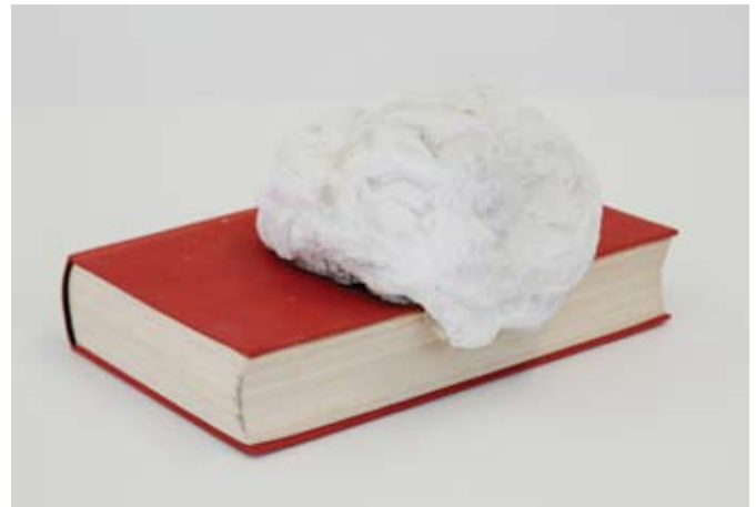
YVONNE KENDALL LEARNING TO READ AGAIN #10 2004 book, crepe paper, newspaper 21 x 26 x 10 cm. Collection Artspace Mackay, Mackay Regional Council

Australian Government Visual Arts and Craft Strategy Visions of Australia Contemporary Touring Initiative