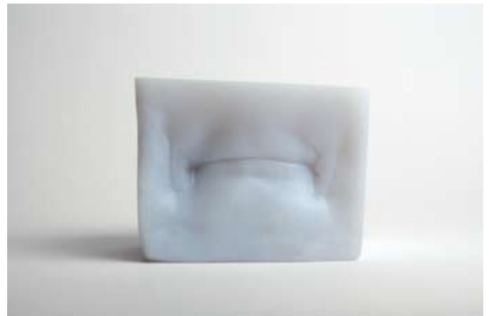
DEB JONES TO EVERYONE WHO SMILED AT ME THAT I DIDN'T KNOW 2010 cast glass 12 x 14 x 9 cm.

Tour De Force: In Case Of Emergency Break Glass is a project developed by artisan and Wagga Wagga Art Gallery, curated by Megan Bottari and toured by Museum & Gallery Services Queensland. The exhibition tour is supported by Visions of Australia, an Australian Government program, and the Visual Arts and Craft Strategy, an initiative of the Australian Government and state and territory governments.