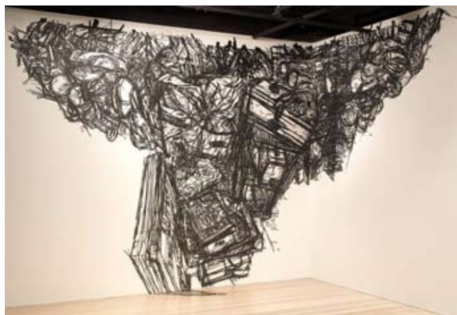
HEESOP YOON JUNKSHOP (installation view) 2009 1/8 inch black masking tape on Mylar 3.34 x 6.56 m.