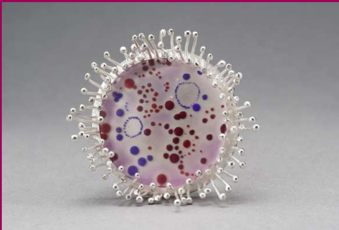
ISOBEL WISE THE EYE OF THE BEHOLDER 2011 925 silver and CR-39 lens plastic 45 x 45 x 20 mm. From TINKER TAILOR SOLDIER SAILOR: 100 Women 100 Brooches 100 Stories