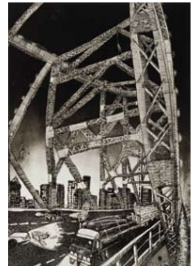
Top: RON MCBURNIE WASHING THE DOG 2000 hard ground etching, roulette and aquatint 17 x 12 cm.