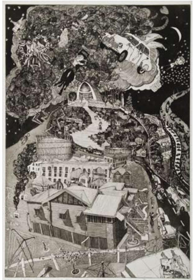
RON MCBURNIE WHITE DREAMING WITH A BLACK CONSCIENCE 1989 from A Rake’s Progress series, hard ground etching and aquatint 74 x 50.1 cm, edition of 30. City of Townsville Art Collection.

This exhibition is complemented by an extensive catalogue of essays, images and anecdotes from the artist to provide visitors with wonderful insights into McBurnie’s work.