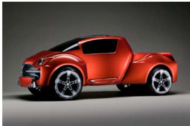
JESSE BOYER DODGE TRUCK high-density foam, mixed media, 44 x 120 x 43 cm