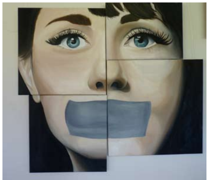
KRISTYN TREMBLE SPEAK UP 2011 (Noosa District State High School)